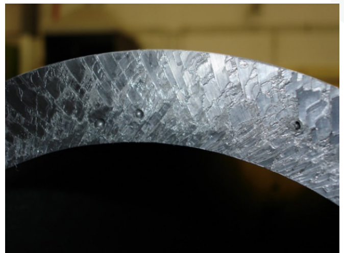
Figure 2. Example of pipe extruded from a resin with elevated moisture content resulting in uneven inner pipe wall (top) and holes in the pipe wall (bottom).