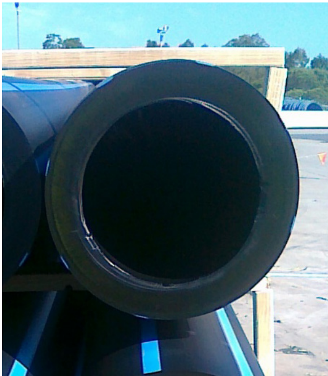
Figure 3. Example of DN500 PN25 pipe made with standard PE100 resin (top), showing severe slumping, and a pipe made within dimensional tolerance produced with a low slump PE100 resin (bottom).